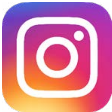
INSTAGRAM 2,720+ followers Our fastest growing social media channel!

INSTAGRAM $50 feed post OR $15 story post*